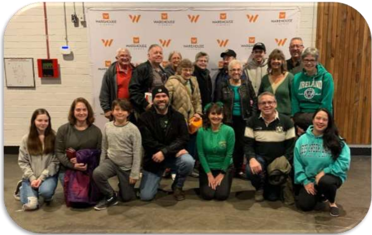
Night Out at the Movies to view “Jesus Revolution” on March 19.