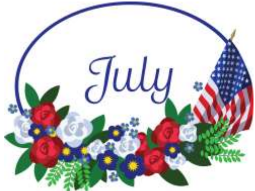
Issue of "The Bridge" What's Happening at Bush Creek

Bush Creek Church of the Brethren 4821A Green Valley Road Monrovia, Maryland 21770 Address Service Requested