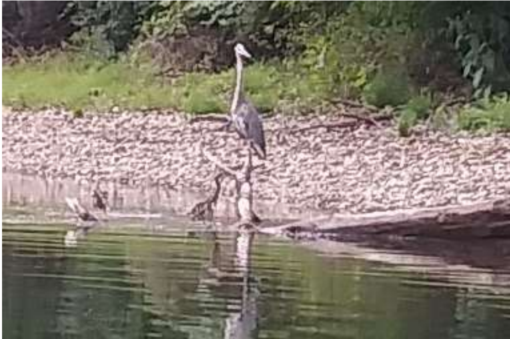
Heron at Lake Marburg

We like to canoe, mainly on lakes and tidal rivers. We definitely enjoy the calmer water, not the white water experiences! Since we choose calmer settings, we also can choose the rhythm with which we paddle. We can paddle rapidly – stroke! stroke! stroke! – and cover a good distance in a fairly short time – but we possibly wear ourselves out in the process. Or we can take a more relaxed approach – stroke ... pause / glide ... stroke ... pause / glide ... stroke. We won't cover as great a distance, but the “journey” is so much richer. We have time to look around and enjoy what we see – herons, cranes and bitterns; fish darting beneath the canoe and leaping from the water; turtles sunning themselves; bright blue dragonflies dancing over the water's surface; wildflowers and butterflies on the shore; birds flitting in the trees. We can enjoy the sounds around us – waves lapping on the shore; leaves rustling in the breeze; birds singing and chirping. Even the water smells good!